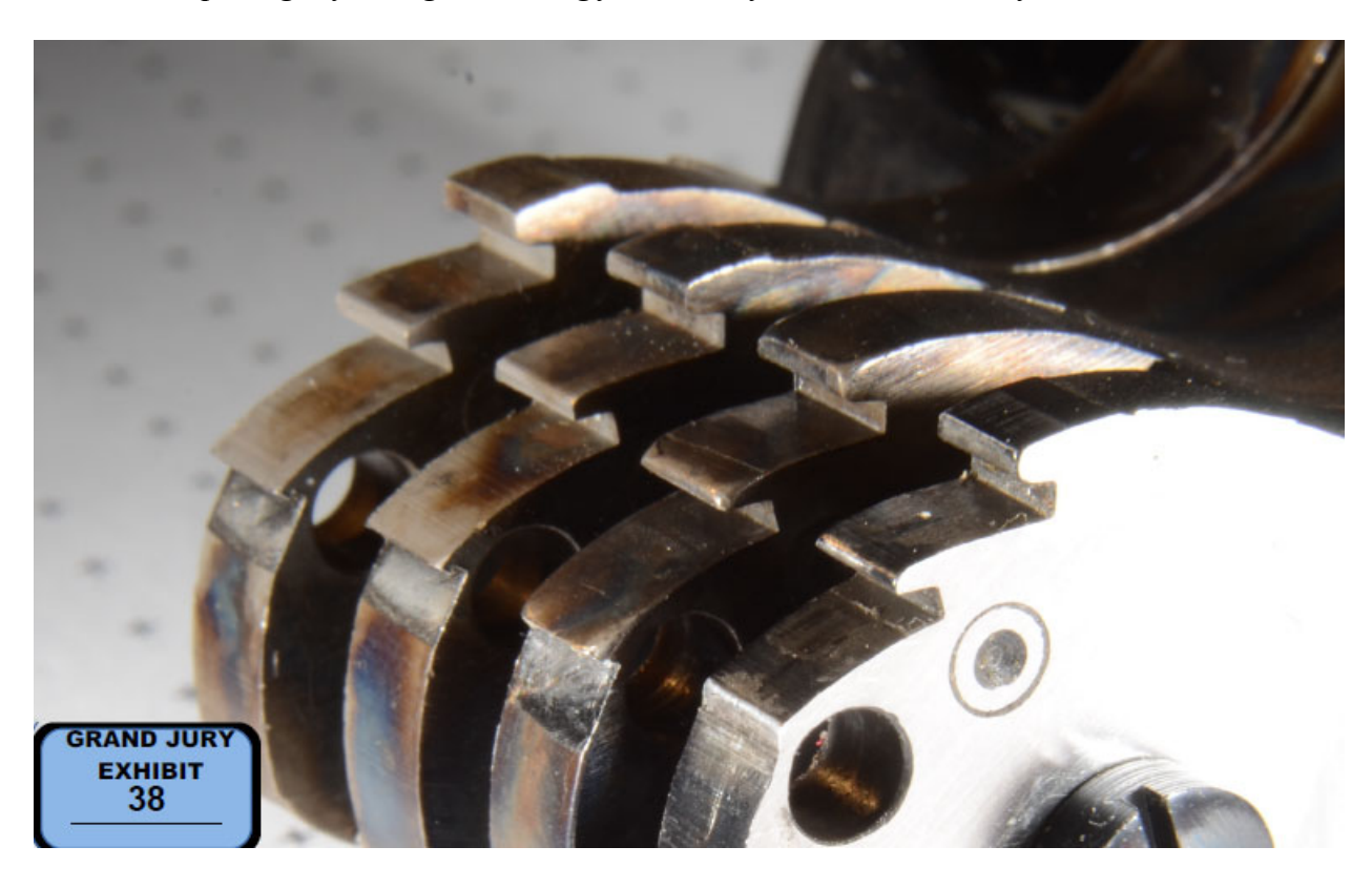
Comparison of altered Rust gun hammer (far right) with unaltered hammers (three left), showing diminished full-, half-, and quarter- cock notches on Rust gun